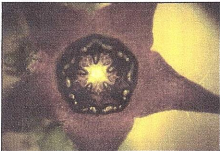
Fig. 3(a) Close-up photo depicting corona of B. richardsii