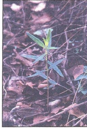
Fig. 1(b) B. dinteri growing in habitat near Harare in a sandy soil