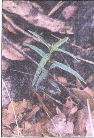
Fig. 1(a) B. richardsii growing in habitat in Zimbabwe in a greyish brown, loamy sandy soil