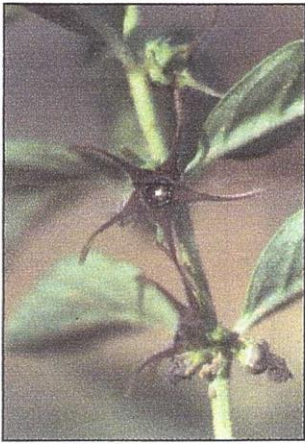
Fig. 2(a) B. richardsii plant in flower depicting the pilose flower, long corolla lobes and distinctive outer corona appendages