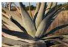
An Aloe showing severe infestation of scale insects. The clear area is so cleaned by wind during the night.

Many a gardener and succulent collector, especially in southern Africa, will have seen the almost overnight, spectacular plants of alocasia.