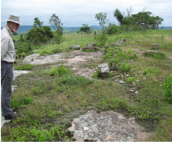
Here is Graham at the original type locality site looking north