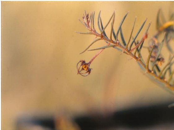
Flower of B. tenellum 1992

There was an amazing plant life on the soils which included a few plants of Brachystelma pygmaeum , B.tenellum of around 30 plants in the few square metres together with, Eriocephalus sp. Crassula sp. Delosperma caespitosum , Hypoxis spp. and an Eucomis sp.