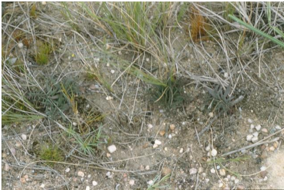
Three well camouflaged plants

in 1992, looking south, note variety of plants