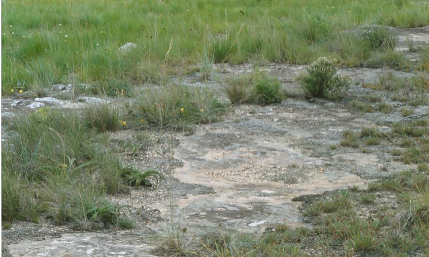
The type locality

in 1992, looking south, note variety of plants